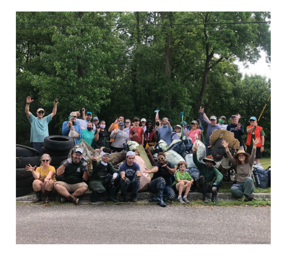
Find a cleanup near you! sirk.org/events

Healthy tributaries are vital to the overall health of our River and when restored, they improve water quality and provide better habitat for plant and wildlife. We're thrilled to partner with White Harvest Farms in this initiative to learn more about the waterway, the community, and how we can do more good – together!